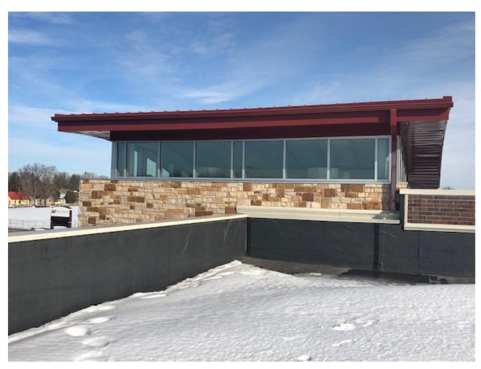
Figure 5 - Northeast Parapet Wall