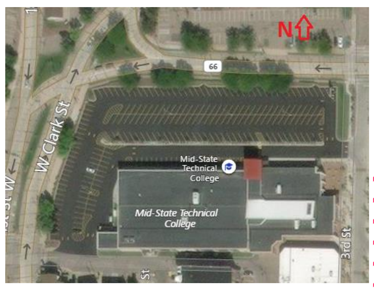
Figure 1- Site Aerial Image

The building site is the central rooftop of a multi-story commercial building located at 1001 Center Point Drive, Stevens Point WI, 5448. The property is within the downtown district. The structure is 21' 6" high from grade to roof plane. The installation location considered is the northwest corner surrounded by a 50" parapet wall on the north and west portions. The typical roof material is fully adhered EPDM membrane over 2 layers of 3" thick rigid insulation. Roof composition is aged approximately 5 years and is in excellent condition. The site contains minimal obstructions and shading considerations (See Below). Access to construction materials is available from multiple points with use of lifting equipment.