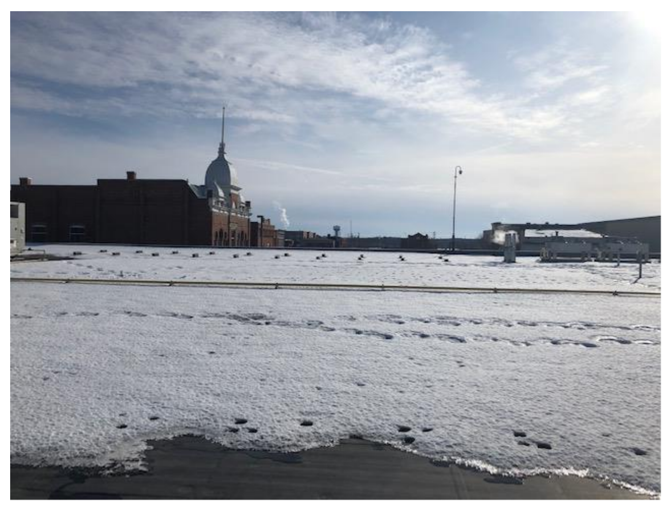
Figure 3 - Installation Area (Facing South)