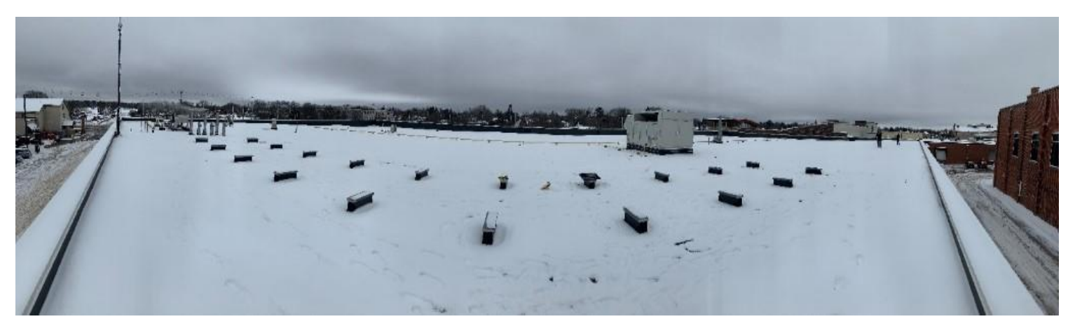
Figure 2 - Panoramic View of Roof Plane