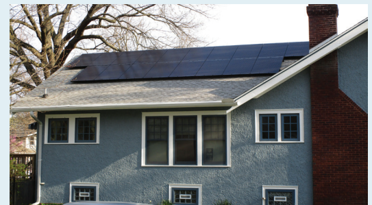
5.10kW array installed on residence as part of Solar Urbana Champaign 2.0 Group Buy.